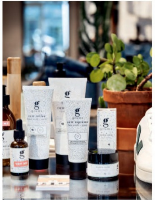
Clockwise from this picture: womenswear at Res-Res; ceramics at Knast; Coco Hotel bedroom; Nørrebro buildings; Collective bakery; Arrebro coffee shop; denim at CHHO; beauty products at Res-Res; exterior of Tú a Tú