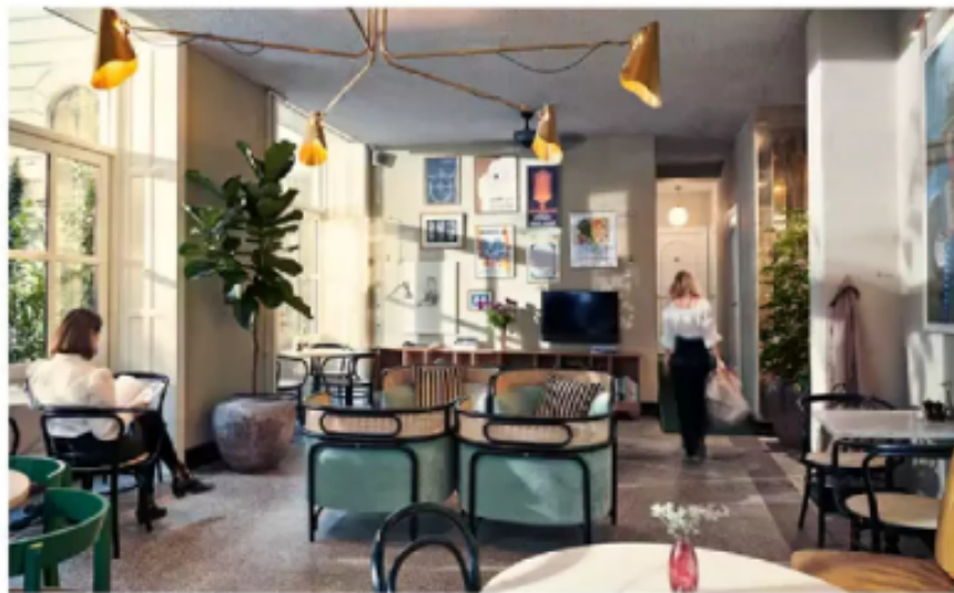
The hotel's Cafe Coco is open to guests and the general public (Coco Hotel)